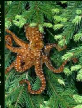
Rare photo of the elusive tree octopus

An intelligent and inquisitive being (it has the largest brain-to-body ratio for any mollusk), the tree octopus explores its arboreal world by both touch and sight. Adaptations its ancestors originally evolved in the three dimensional environment of the sea have been put to good use in the spatially complex maze of the coniferous Olympic rainforests . The challenges and richness of this environment (and the